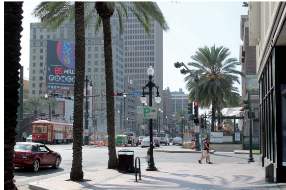
Surroundings of the congress venue: Canal Street, French Quarter, New Orleans